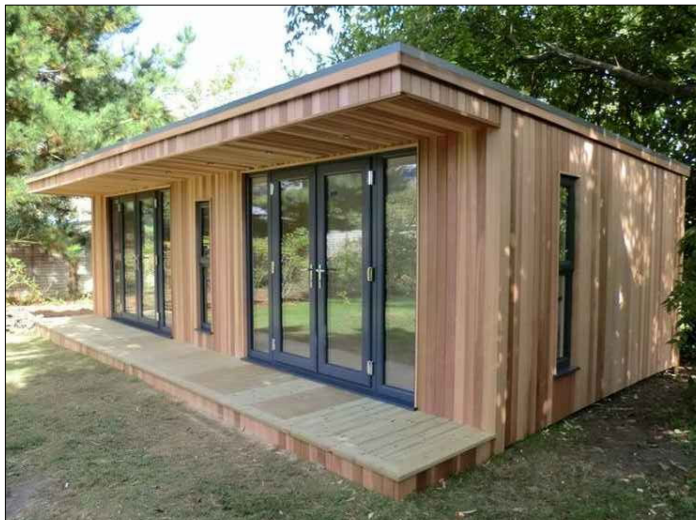
○ Cladding and Fenestration