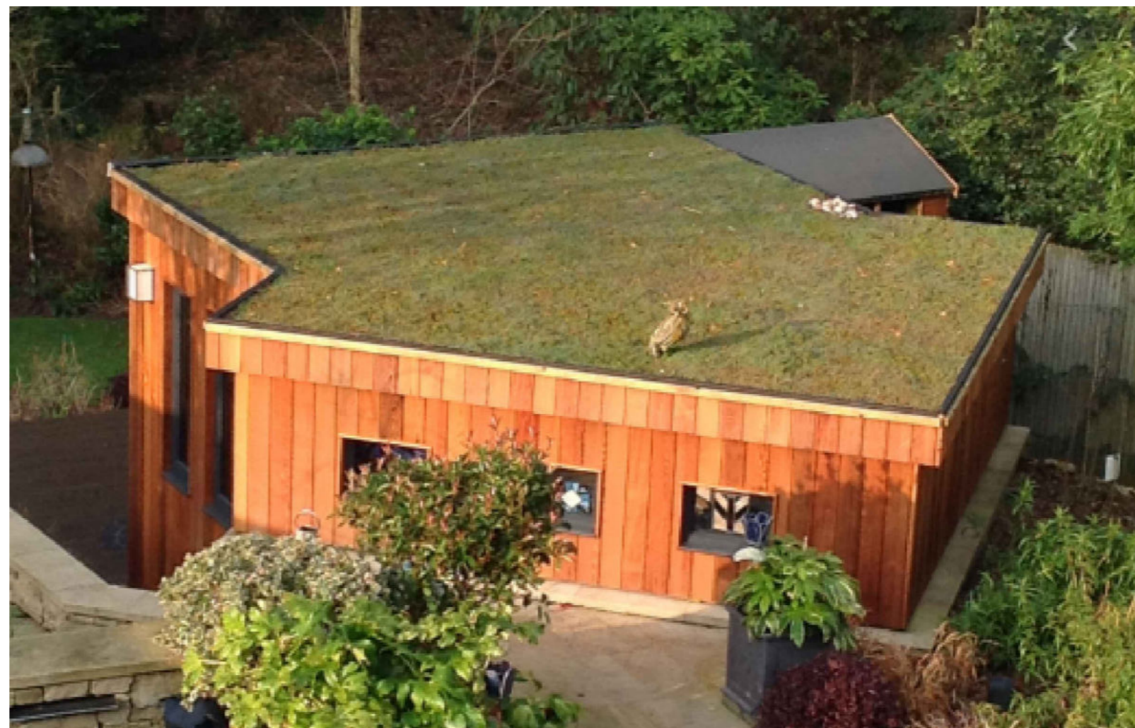
○ Green Roof